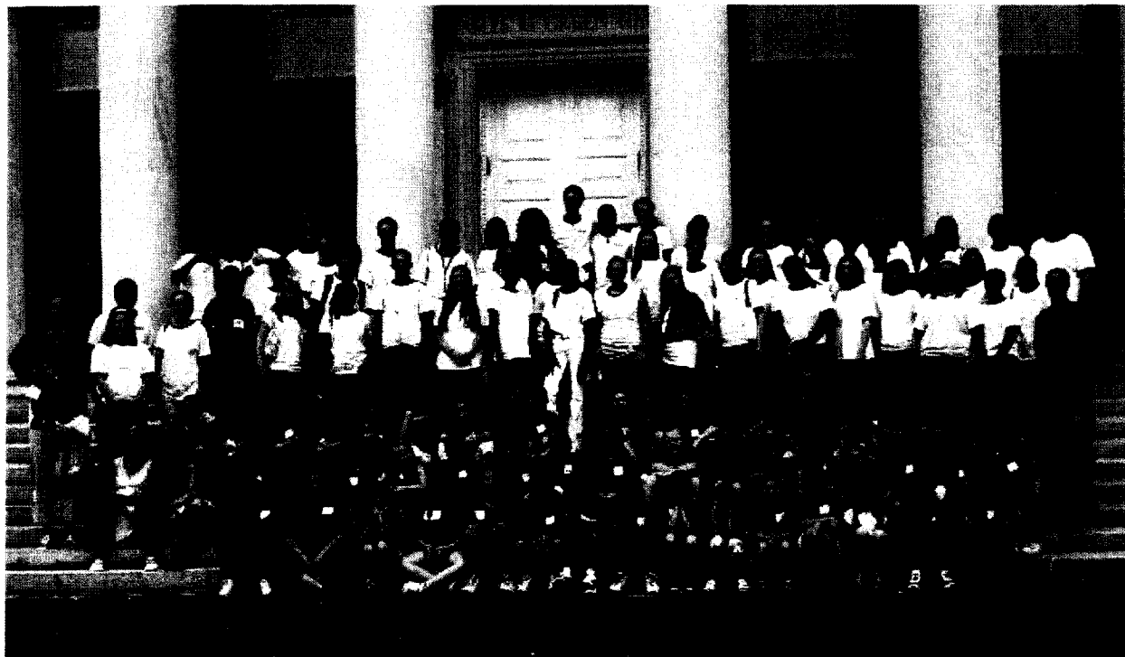
Urban Teacher Academy 2007

pilot to two additional regional centers where universities will seek students from urban areas to participate in summer academies.